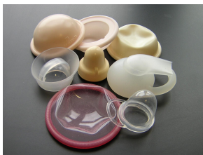
Cervical barrier methods