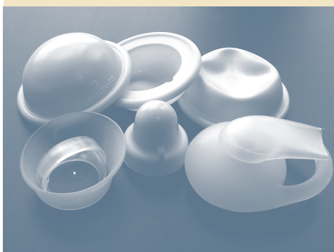
FIGURE 1. CERVICAL BARRIERS*

Clockwise from upper left: Ortho® All-Flex diaphragm, Millex Wide Seal® diaphragm, Ortho® Coil Spring diaphragm, Lea's Shield®, Prentif cap, FemCap™.