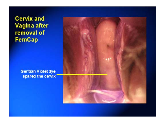
Photograph highlighting the protective effect of the FemCap as a vehicle for microbicides.

Amphora (ACIDFORM) is a microbicide that protects the mucous membrane from HIV invasion